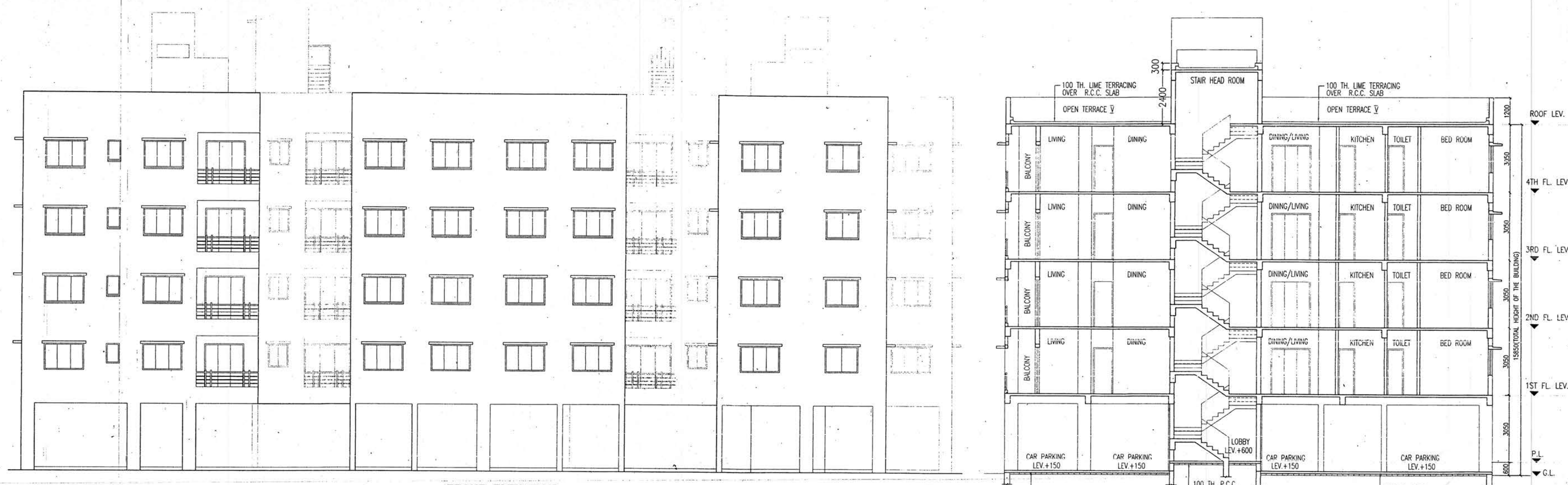
FRONT ELEVATION BLOCK - 10

RAJ AGRAWAL & ASSOCIATES 6B, ROYD STREET, KOLKATA-16.